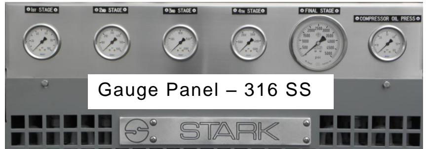
Gauge Panel – 316 SS