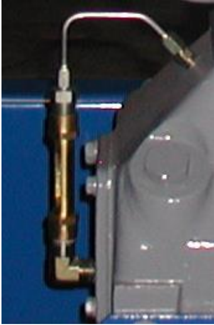
Oil Level Sight Glass