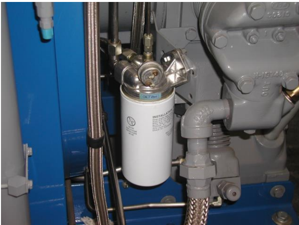
Spin Off Oil Filter