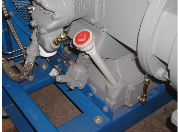
Oil fill extension & bell mouth